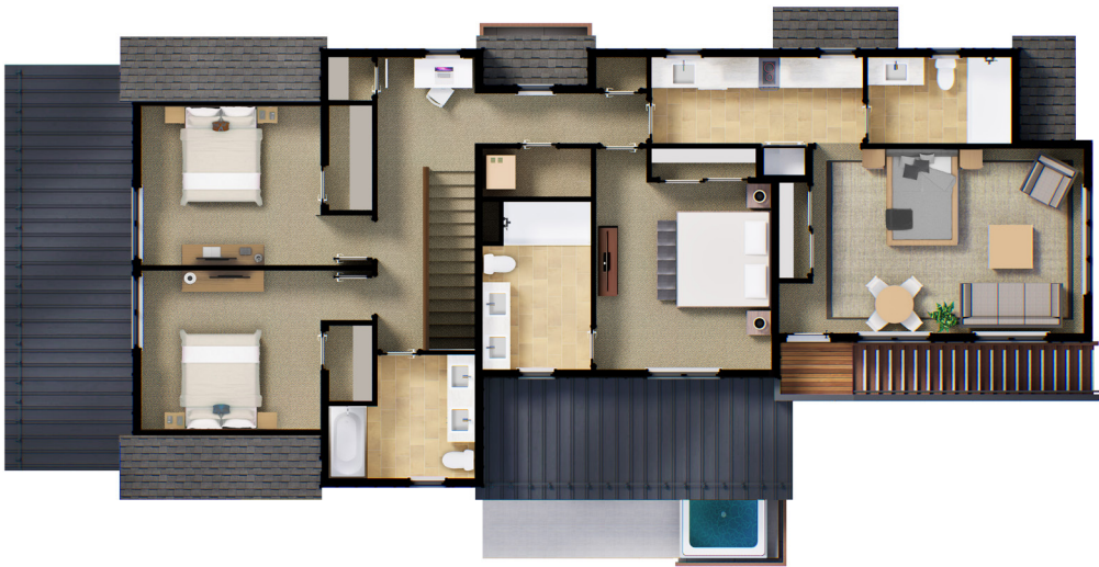
UPPER LEVEL + 1 BEDROOM ADU