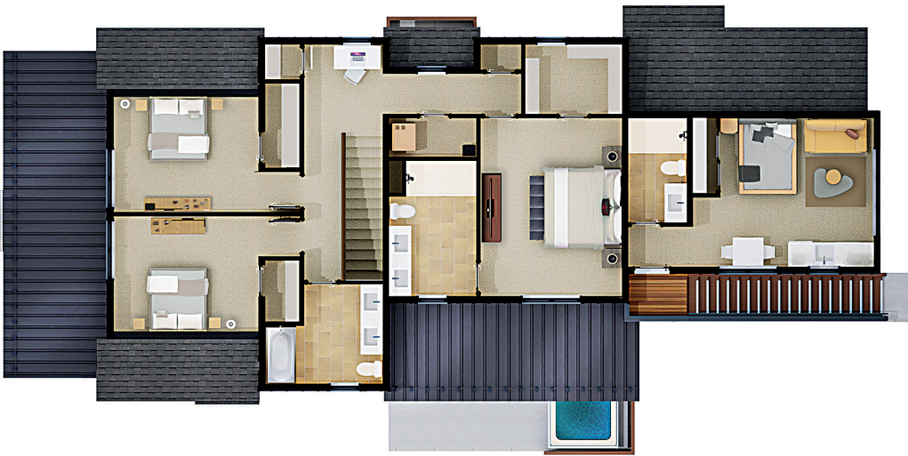
UPPER LEVEL + STUDIO ADU